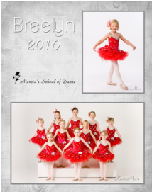
Dance Mate Group & Individual! Customized with name & year 8 x 10 overall size