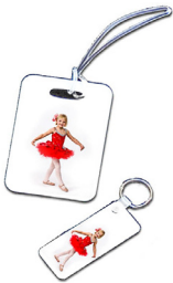
Bag Tag & Key Chain